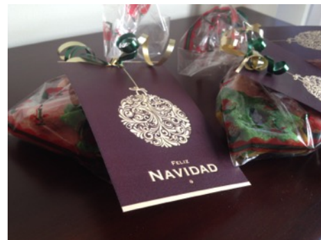
Christmas cookies and invitation

This Friday we are hosting a Christmas party for our neighbors. As we passed out the invitations with homemade cookies attached, the neighbors were excited to participate in an American Christmas party. Our prayer is that that it would be a time of sweet fellowship amongst the neighbors and that we would have the opportunity to get to know them better and gain their trust. One of the first things a person sees when they walk into our home is a large wall with the verse, "As for me and my house, we will serve the Lord," printed in Spanish. As I hung this verse, I prayed that it would be a clear message to those who come into our home that we do serve the Lord, and that it is He who shapes our lives. We pray that as these neighbors come to enjoy a Christmas celebration, they will leave with an interest in who we are as a Christian family.