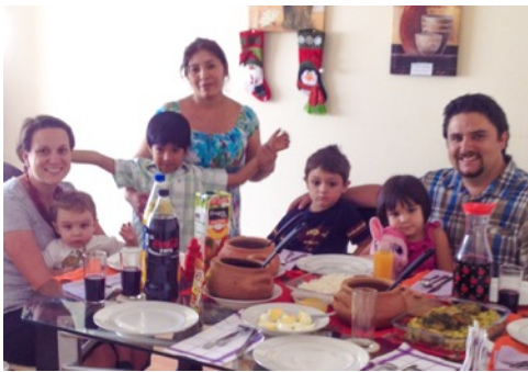
Lunch with new friends in our neighborhood